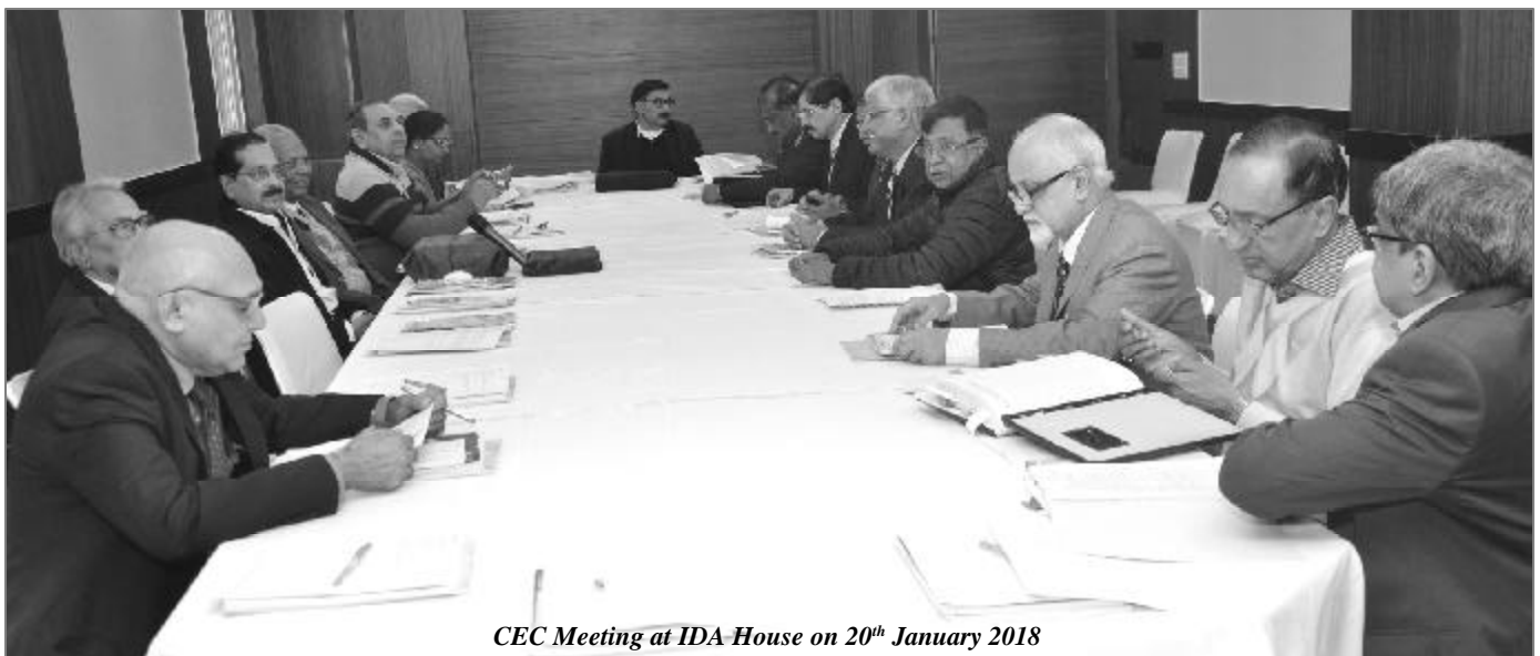
CEC Meeting at IDA House on 20 th January 2018

As the new CEC assumes office we wish all its members the very best for their tenure.